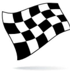
BLACK & WHITE CHEQUERED Finishing flag – end of race or practice