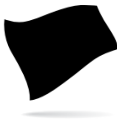
BLACK Enter pit lane on the next lap