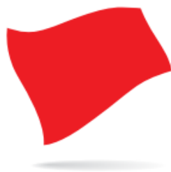
RED Stopping the race or practice