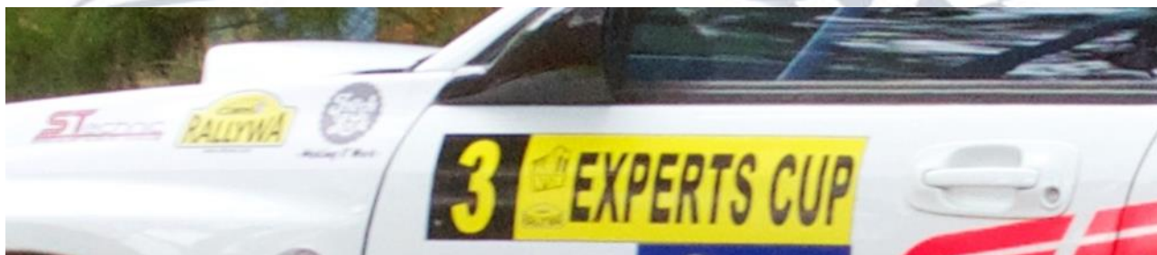
Correct orientation of header sticker for doorplate, car number at front of vehicle